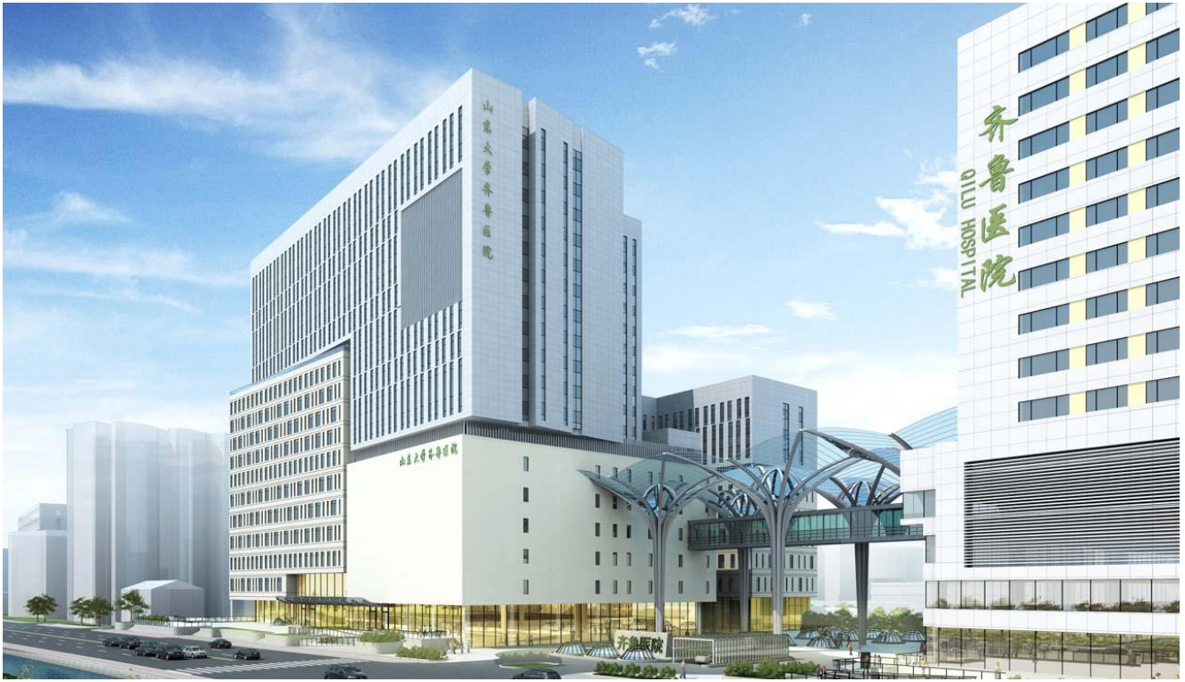
Qilu Hospital (Qingdao) · Boshi Building, Hefei Road 758, Shibei District · Opened 2013, Phase II completed 2023